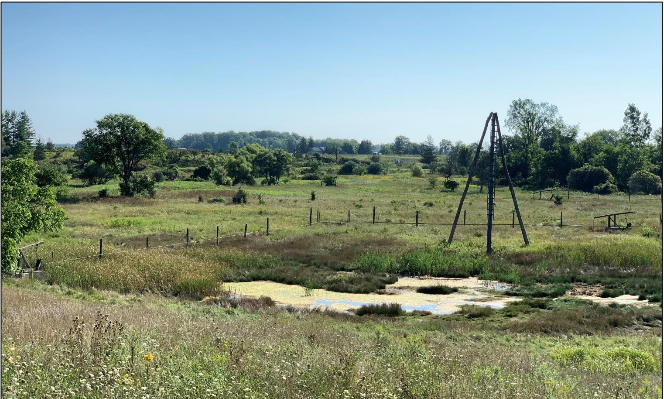
PHOTO: View of Canada's First Gusher, 1862, The Shaw Well. Fairbank Oil Fields.

The Fairbank Oil property, founded in 1861, continues to produce oil from the majority of its 350 wells with original extraction systems and technologies. These systems have been in use for more than 150 years. The Oil Museum of Canada property includes the 1858 site of the first commercial oil well in North America. The museum is dedicated to interpreting the discovery and extraction of oil. It also shows the region's influence on the oil industry that emerged during the second half of the 1800s and spread through the world as a transformative new source of energy.