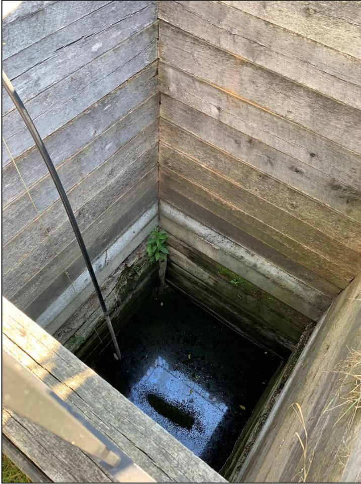
PHOTO: View into the restored cribbed well at Fairbank Oil.