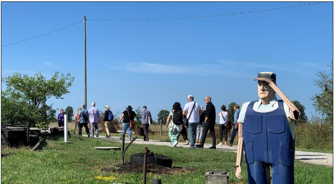
PHOTO: Conference participants tour Fairbank Oil Fields, while one of the iconic metal sculptures interpreting the site watches over the operation.

Rail transport for oil gave way to trucking and the crude from all of Ontario is trucked by Harold Marcus Ltd., out of Bothwell.