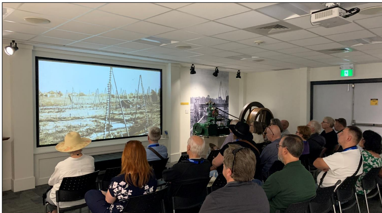
PHOTO: Participants view the film "The Spark that Ignited the World" on the history of the oil industry in Lambton County.