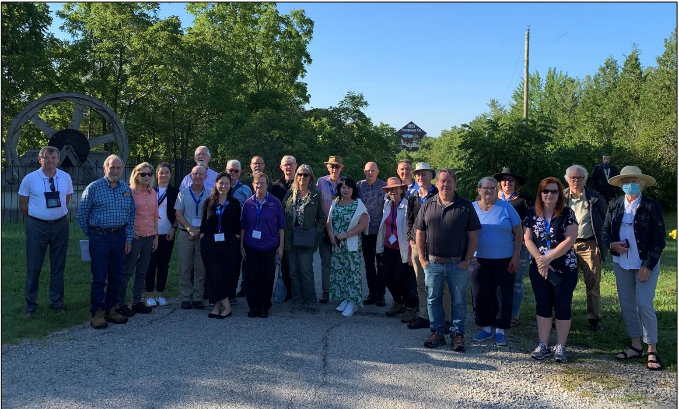
PHOTO: Conference participants begin their tour of Fairbank Oil Fields.

The objectives of the meeting were to present the TICCIH thematic study on the oil industry (which can be downloaded from the Thematic Studies and Published Reports page at ticcih.org ), and to discuss the nomination of sites to the UNESCO World Heritage List, including a possible serial nomination to involve multiple sites.