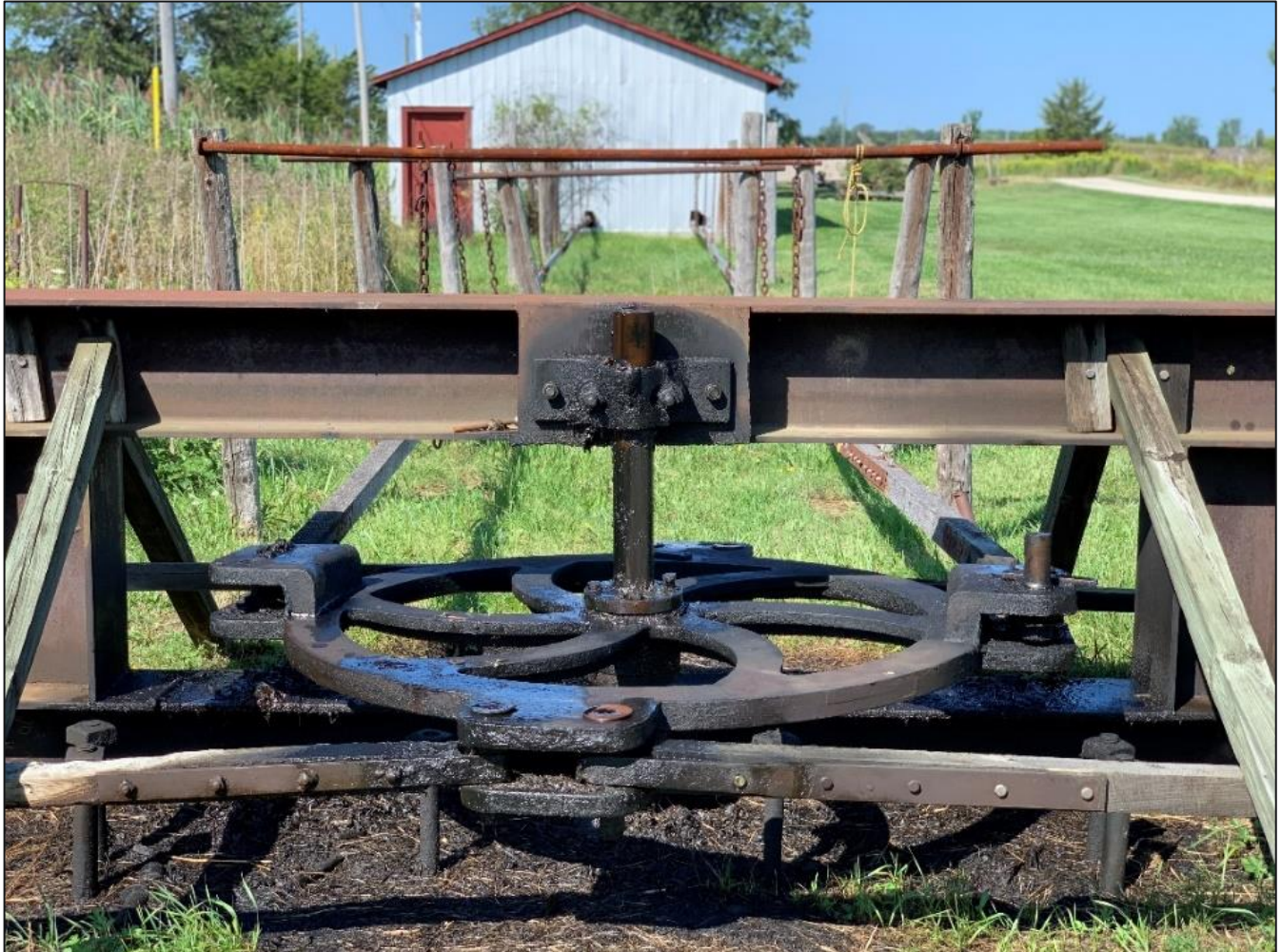
PHOTO: Field wheel located outside of the James Rig.

In total, Fairbank Oil has approximately 10 km. of jerker line.