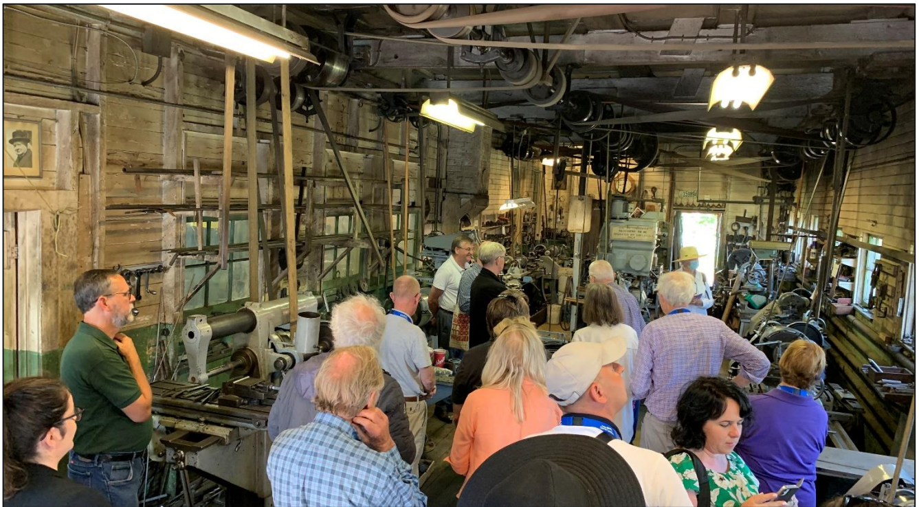
PHOTO: Participants tour the interior of the Baines Machine & Repair Works, Petrolia.

The original overhead line shaft still powers many lathes and milling machines. The shop produces leather oil well cups, brass packer stuffing boxes and brass oil well valves.