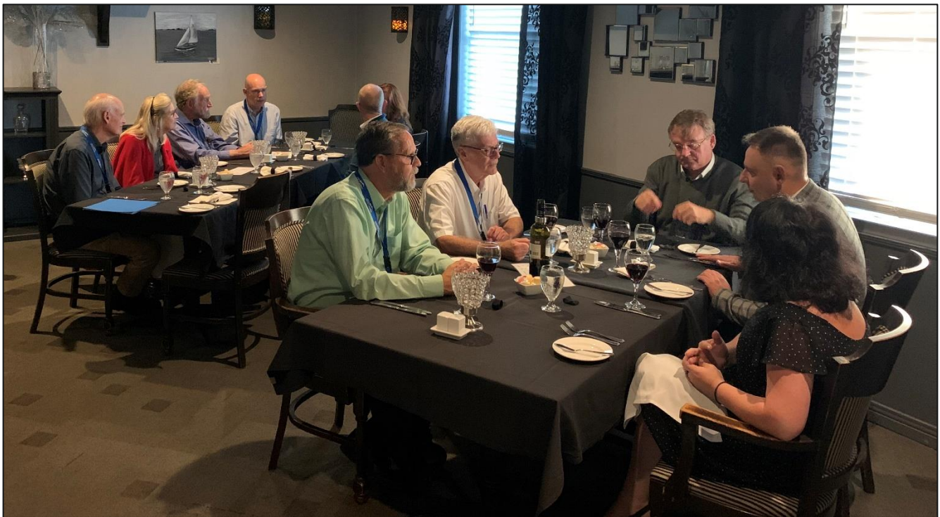
PHOTO: Conference participants attend a dinner following the presentations and panel discussions.

It was noted that Canada’s Tentative List will not reopen for nominations until at least 2027, providing an opportunity for the potential partners of a serial nomination to collaborate and align management plans with common actions and activities to ensure a strong application. Dr. Oglethorpe concluded with a summary of the conference proceedings, underscoring the links between the Polish and Canadian early oil sites and the importance of ensuring the protection of these industrial heritage landscapes.