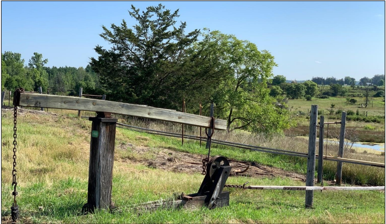
PHOTO: A pumpjack in operation at Fairbank Oil Fields.