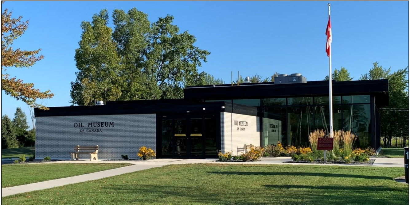
PHOTO: The Oil Museum of Canada National Historic Site, main exhibition building.

The newly refurbished Oil Museum is operated by the County of Lambton and opened in 1960. It has a number of interactive displays covering the history of the local oil fields and development of early oil technology.