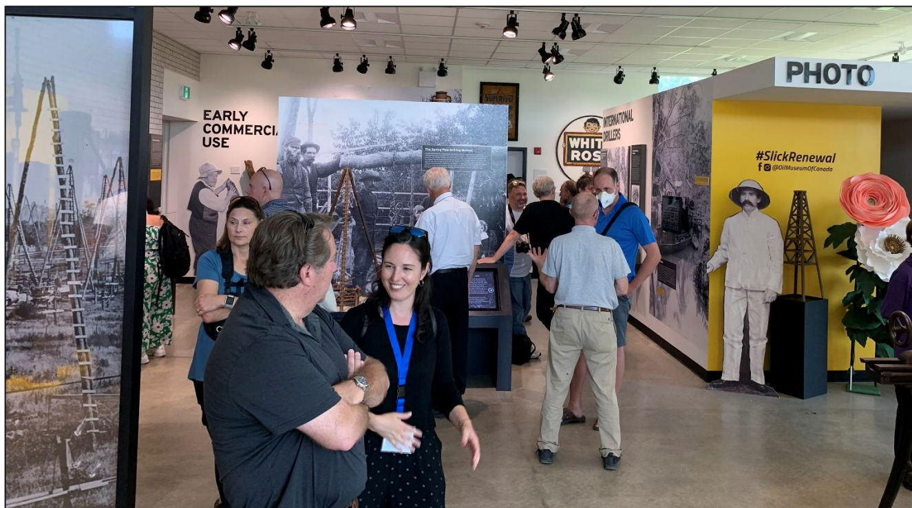
PHOTO: Participants view the newly renovated exhibition gallery at Oil Museum of Canada.