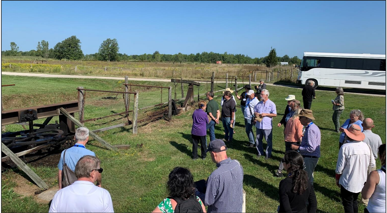
PHOTO: Participants view the field wheel and jerker rod system up-close.

The James rig, shown on the tour, is about 90 years old, replacing an earlier one. Its bullwheel measures 1.8 meters and babbit metal is used on the main shafts. The leather transmission belt of early days was replaced with a synthetic belt, which does not stretch or slide off.