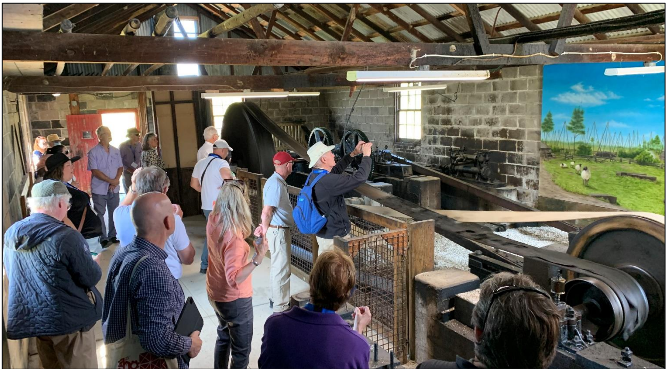
PHOTO: Participants tour the James Rig.

Oil wells require regular maintenance. From the 1860s to the 1950s, this was done in Oil Springs by constructing three-pole wooden derricks over each well. Cables and pulleys linked a team of horses to the three-pole derricks and as the horses pulled forward as they walked around the derrick, they lifted pipes and rods out of the well so the oil men could be repair or replace them. These inexpensive derricks were made from ash trees, which grew abundantly. The hundreds of derricks filled the landscape and in the 1950s were replaced with portable pulling machines, usually pulled by a tractor. To mark the site of the Shaw gusher and the nearby Bradley gusher of 1862, Fairbank Oil built replicas. Fairbank Oil also has the last remaining original three-pole derrick but it is not easily accessed.