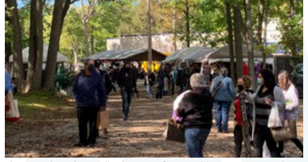
The annual Lambton Fall Colour & Craft Festival drew approximately 3,500 people to LHM from October 16-17.