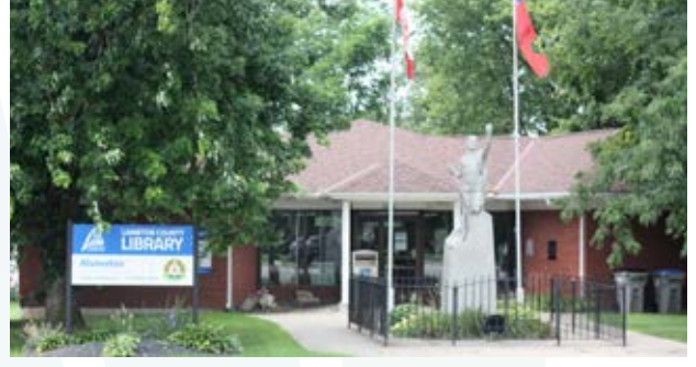
New exterior signage with Lambton County Library and municipal partner branding installed at the Alvinston Library.

content for heritage enthusiasts. The OMC Drilling Deeper video series, a collection of 15 educational episodes hosted by museum staff on the history of the oil industry, attracted 3,448 views on the museum's YouTube channel.