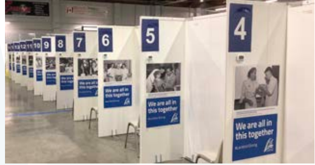
Photographs of past community immunization efforts from the Archives line the pods at the Point Edward mass immunization clinic.