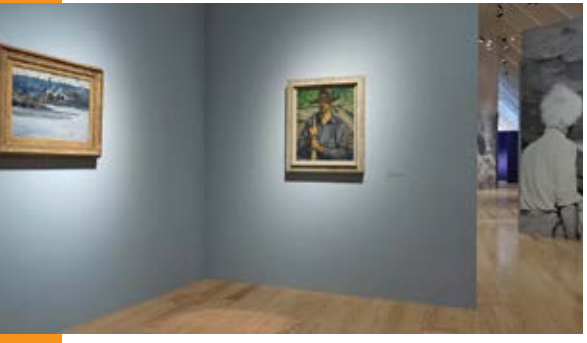
The Lumberjack by Edwin Holgate, on loan from the JNAAG permanent collection and featured at the Schirn Kunsthalle Frankfurt in Germany as part of the exhibition Magnetic North .

The Cultural Services Division endeavours to pursue opportunities that raise our profile at the provincial, national and international level, while maximizing our ability to contribute to the cultural, social and economic vitality of Lambton County.