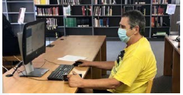
Public computer use by scheduled appointment resumed as part of Step 3 of the Province's Roadmap to Reopen in September of 2021.

history in Lambton, the history of photography, how to research your property, the importance of biodiversity, pollinators, and invasive species, war remembrance, the history of the Canatara cabin, and early settlement in Enniskillen. The gallery also led an Art & Ideas series, and continued its Inspirational Moments adult classes offered in partnership with the Sarnia Lambton Alzheimer Society . In total, these 37 museums, gallery and archives virtual programs and panel presentations attracted 3,083 total views (live and post event on the YouTube channel).