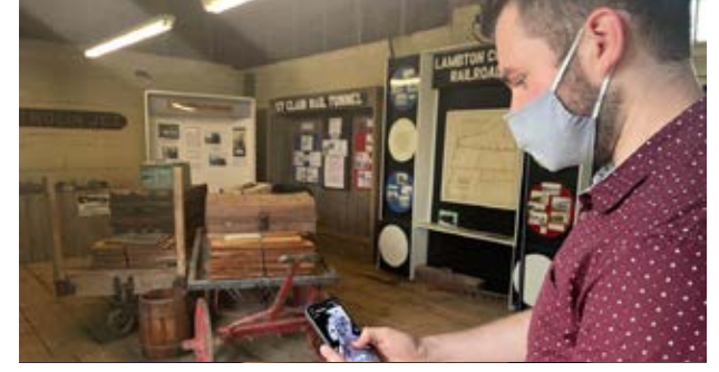
Student employees worked over the summer months to research and design virtual tours of OMC using a 360-degree camera.