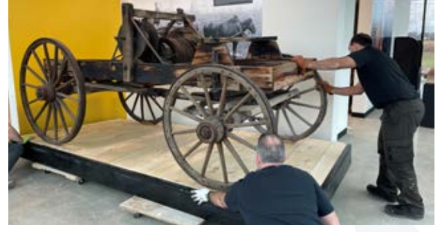
Museums, Gallery & Archives Department staff install an oil wagon as part of the new exhibition at the Oil Museum of Canada.