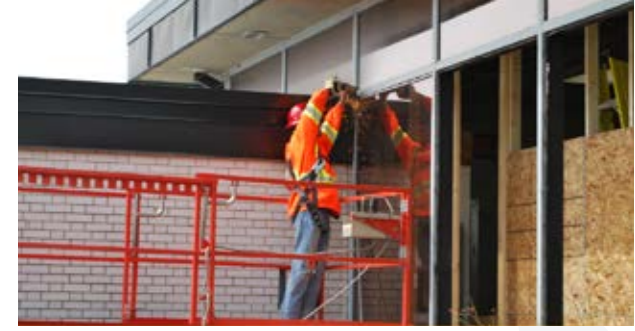
Workers remove the 60 year old window curtain wall as part of extensive renovations at Oil Museum of Canada in 2021.