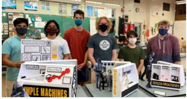
Students at Northern Collegiate Institute produced three designs for an interactive display on 'Simple Machines' to be featured at OMC.

Sarnia Library Theatre also reopened for performances with live audiences in August. with capacity limits and COVID-19 restrictions in place. By the first week of September, all 25 Lambton County Library locations reopened. In 2021, the libraries supported 3,753 public computer use appointments, and circulated 244,730 physical items.