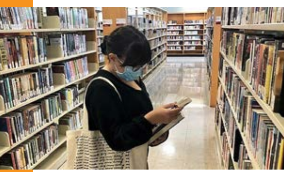
Public access to libraries for curbside pickup service, inperson browsing and scheduled computer use, Wi-Fi use and academic research resumed in September at all 25 locations with COVID-19 restrictions in place.