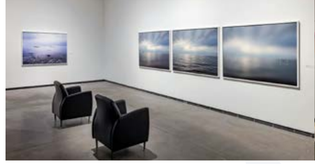
A series of photographs of Lake Huron form part of the exhibition Focus Finder by artist Susan Dobson at the JNAAG.