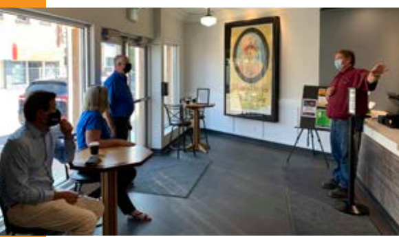
Members of the Creative County Committee participate in a tour of the recently renovated Kineto Theatre, which received sponsor support through the County's Creative County Grant Program.