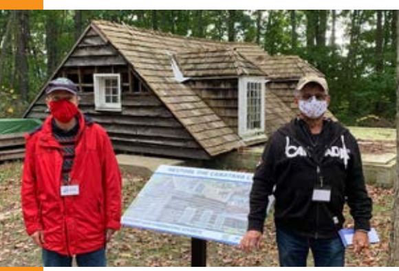
Canatara Cabin restoration committee volunteers stand with a plaque marking the build site at LHM.