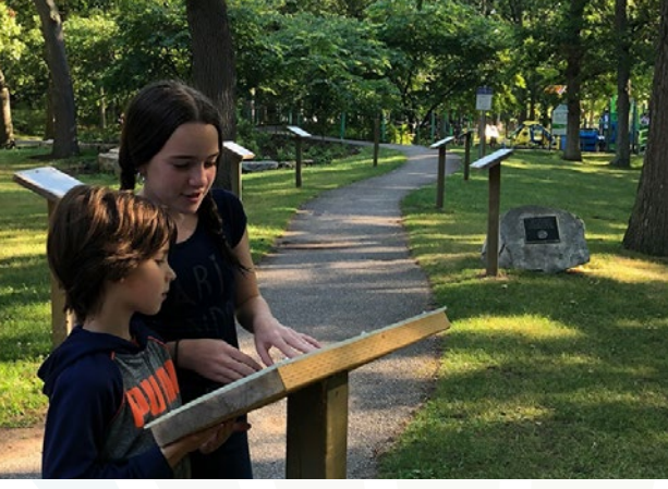
Patrons experience the StoryWalk offered by Lambton County Library in Canatara Park, a unique way to merge physical activity with literacy for both adults and children.