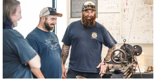
In the summer of 2022, OMC had over 3,450 visitors from 21 different countries, including this group tour from Aecon Utilities.