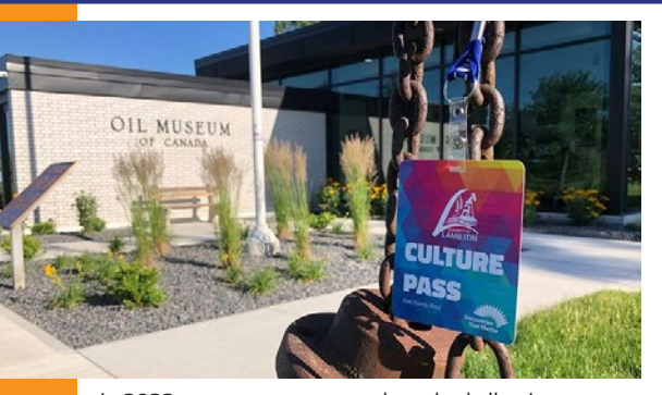
In 2022, a new program was launched allowing Lambton County Library cardholders to borrow a Culture Pass for FREE up to seven days. The pass gives an individual or family free admission to a variety of cultural institutions across Lambton County.