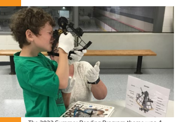
The 2022 Summer Reading Program theme was A Universe of Stories . Participants of all ages were invited to explore stories from across the universe, and engage in space-related STEAM activities like this star gazing program at Mooretown Library that demonstrated how sailors navigated the seas with sextants and other devices from the Moore Museum collection.