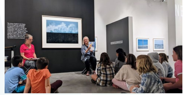
Students participate in a tour of the photography exhibition One Wave by artist Ned Pratt. featured at the INAAG.