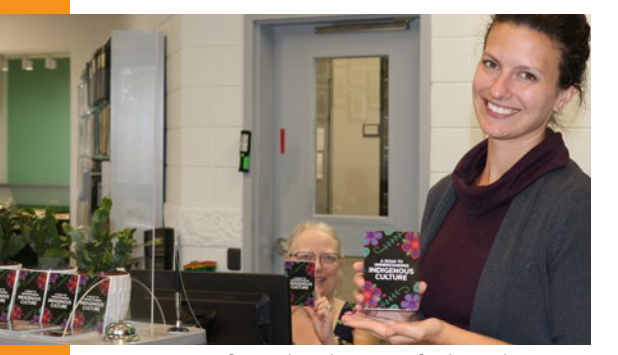
LCA was one of 29 cultural services facilities that now offer patrons free copies of A Road to Understanding Indigenous Culture booklets with a goal of helping those in our community form a better understanding and connection with each other.

In 2022, Lambton County was recognized with two significant awards from professional sector organizations. The Lambton County Archives was awarded the Archives Association of Ontario Institutional Award, presented to archival institutions that have made significant contributions to the advancement of the archival field, while demonstrating innovation with outstanding programs or services. The award recognized the Archives' recent project Remembering Lambton County's 2010 Snow Emergency. The Oil Museum of Canada was presented the Award of Excellence in Exhibitions. by the Ontario Museum Association. The award recognizes the recent renovation project that transformed exhibition space, improved accessibility, and replaced end of life equipment and building systems.