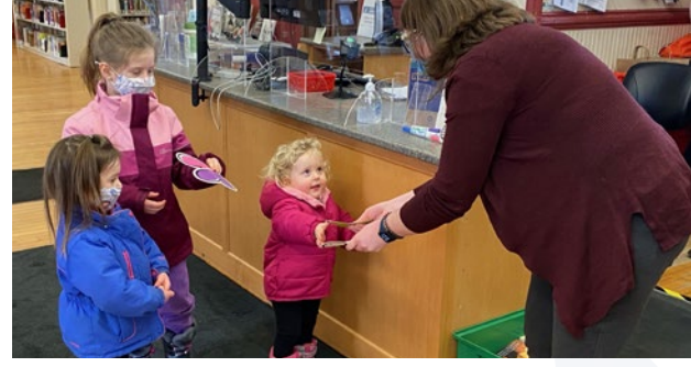
Library patrons were invited to create Valentine's Day cards to be delivered to residents at participating Long-Term Care homes.