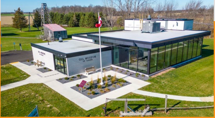
Oil Museum of Canada National Historic Site, 2423 Kelly Road, Oil Springs