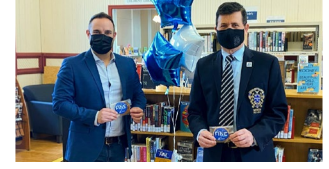
On March 1, 2022, Lambton County Library adopted a fine free policy, eliminating overdue fines to create a more accessible service.