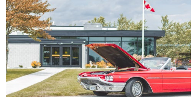
In August of 2022, Oil Museum of Canada welcomed the Southern Ontario Thunderbird Club for a group tour of the museum site.