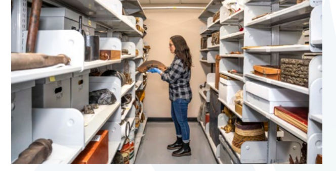
OMC staff unpack and organize artifacts on repurposed library shelving in the new collections storage area, following renovations.