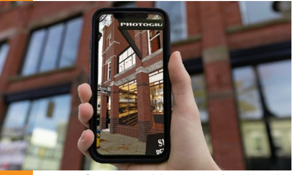
As part of its Re View exhibit series marking the 10th anniversary of the JNAAG at the Lochiel Street location, the gallery created an augmented reality experience where visitors could scan a QR code with a mobile device to experience what the original Thom Building would have looked like.

The Cultural Services Division aims to provide unique experiences that engage and inspire visitors. This is achieved through the presentation of exhibitions and interpretive displays, programs and activities, tours and events, and the appropriate use of emergent technologies to enhance the visitor experience.