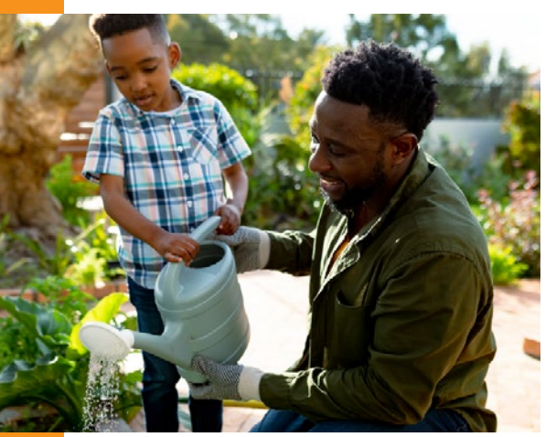
The One Seed Lambton program saw 3,000 seed packs of Royal Burgundy Bush Beans distributed at library locations across the County.

With increased demand on eLibrary services, the library continued to expand its electronic collections in 2022, with 5,477 new Overdrive titles (digital eBooks, eAudiobooks, streaming video and periodicals) added to the collection. The library also continued to subscribe to databases to give the library's 20,760 active card holders convenient access to millions of titles online to pursue their areas of interest. Lambton County Library also continued to purchase new titles as part of the management of its physical collection.