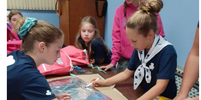
Girl Guides from 1st Courtright Guides visited Mooretown Library to learn about circuits as part of the library's STEAM programming.