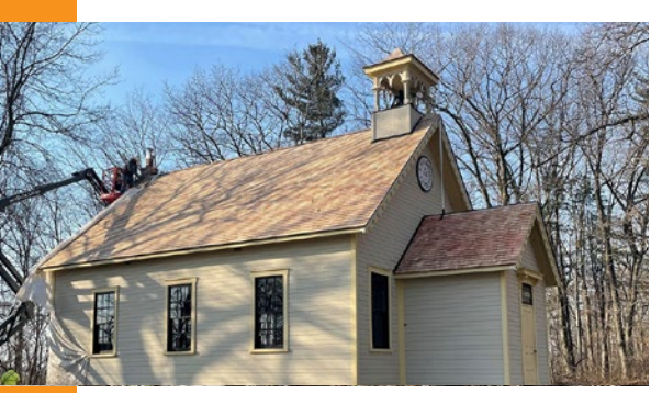
The cedar shingle roof of the historic Rokeby School at Lambton Heritage Museum is replaced as part of ongoing restoration work.

The Cultural Services Division strategically manages and strengthens Lambton County's collections and associated research, developing and enhancing the important museum, gallery and library collections entrusted to the County.