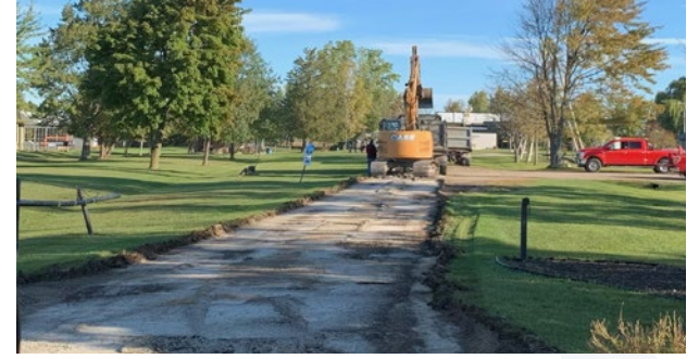
Workers prepare a new asphalt laneway as part of parking and site improvements at Oil Museum of Canada in September.