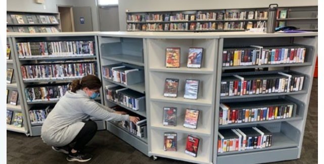
Staff at Forest Library set out the collection on new shelving to welcome patrons back after extensive interior renovations.

In 2022, 12,374 new titles (28,718 total new items) were added to the library's physical collection of 191,237 items across 25 library locations. Cardholders borrowed 497,256 physical items in 2022.