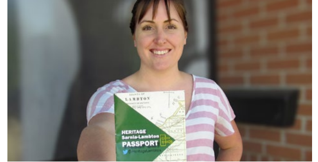
Residents were invited to re-discover Lambton County museums by completing the Heritage Sarnia-Lambton Passport Challenge.