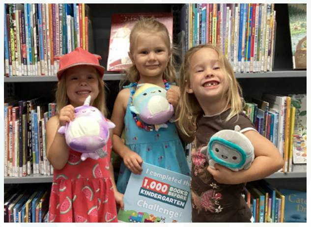
Proud graduates of Lambton County Library's "1000 Books Before Kindergarten Challenge" pose for a photo with their summer reading program prizes.