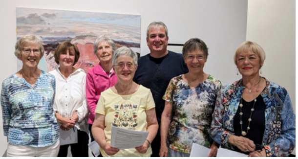
The "singing docents" prepare to engage the visiting public in a tour of John Hartman's exhibition Many Lives Mark This Place at JNAAG.

Lambton Heritage Museum (LHM) is entrusted with the care of over 25,000 historic artifacts which preserve the history of Lambton County. Situated on 30 acres, the museum maintains six historic buildings, two display buildings and one main exhibition centre. The museum is open year round, and provides picnic grounds and the 1km Woodland Heritage Trail. LHM has evolved from a passive museum site to an active experiential tourism destination.