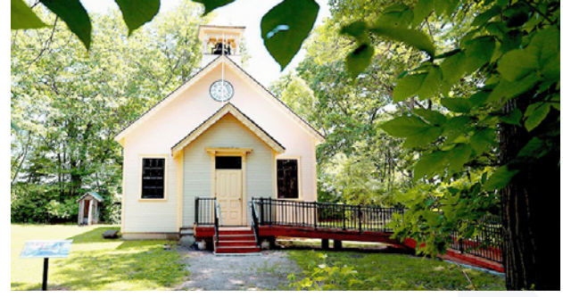
New entry ramps are installed at the Rokeby School (pictured), Cameron Church and Tudhop Cabin to improve accessibility at LHM.