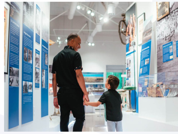
Visitors to Lambton Heritage Museum take in the new Lambton Gallery after extensive renovations to address facility repairs, revitalize the exhibit and enhance accessibility.