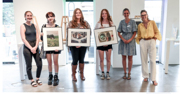
Teen Photo Contest participants showcase their work as part of the Humans of Lambton exhibit at JNAAG, in collaboration with LCL.