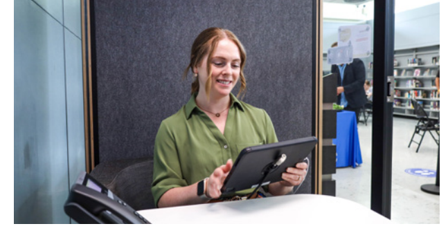
The Connection Cube private meeting space was launched at Sarnia Library in partnership with the Sarnia-Lambton Ontario Health Team.