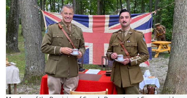
Members of the Dominion of Canada Reenactment Corps provide demonstrations at the Experience the First World War event at LHM.