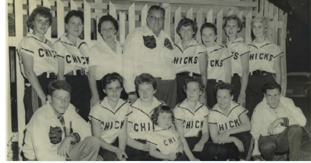
Image of the 'Florence Chicks' softball team, 1958, displayed as part of an exhibition at the Florence Library coordinated by LCA.

Combined, the YouTube channels of the Division also attracted over 35,000 views, with over 1,200 hours watched and 262 subscribers.