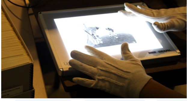
LCA staff view a negative from the collection using a light box in preparation for the 2024 exhibition Hockey at LHM.

In 2023, the museums, gallery, and archives received a number of generous donations to the permanent collections of each site from area residents. There were 71 donations to LHM, 15 to OMC, 101 to LCA and 3 to JNAAG, which resulted in hundreds of individual