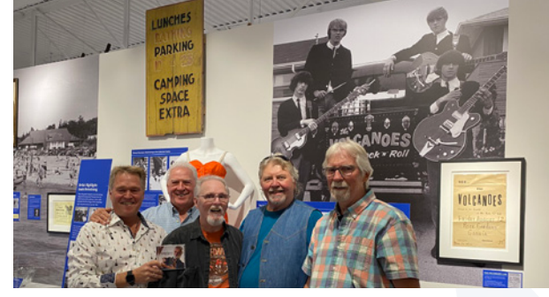
Members of the 1960s Sarnia rock group 'The Volcanoes' visited LHM to reminisce and check out a display celebrating the 1960s.