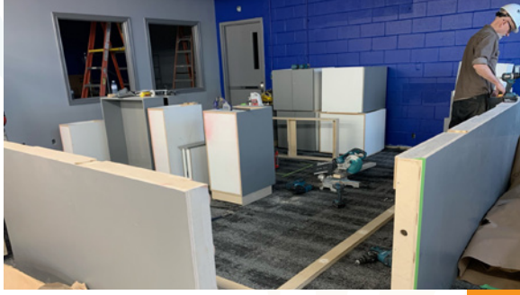
A new accessible service desk is installed as part of the renovations to the former community hall at the Clearwater Arena in Sarnia, in preparation for the opening of the new Clearwater Library, scheduled for February of 2024.