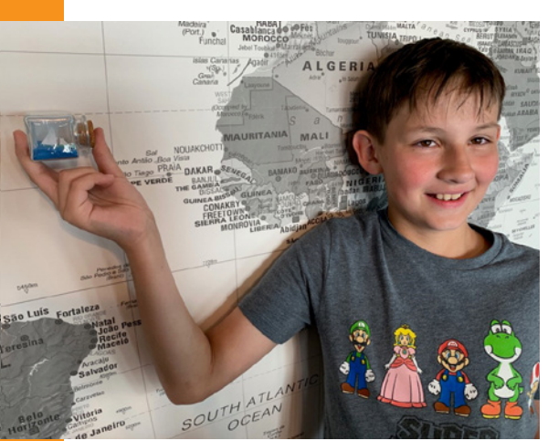
A young library patron shows off his ship-in-a-bottle DIY, a tricky origami challenge included as part of the Summer Reading Program registration kits made available to families.

The Cultural Services Division strategically manages and strengthens Lambton County's collections and associated research, developing and enhancing the important museum, gallery and library collections entrusted to the County.