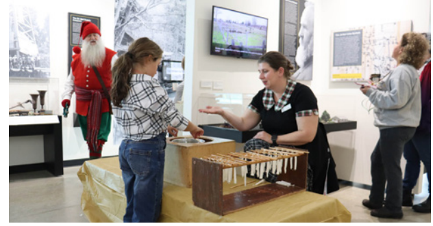
A student participates in a candle-making activity at OMC as part of the popular holiday open house programs attended by area schools.