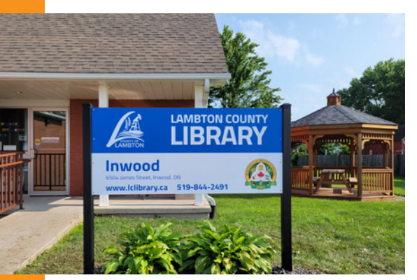
As part of the Division's ongoing commitment to enhancing the County brand and recognizing municipal partners, new signage is installed at various library locations throughout the County.

The Cultural Services Division strives to promote and enhance awareness of cultural opportunities across Lambton County, and provide access to relevant and engaging exhibitions, programming and services for residents at all phases of life.