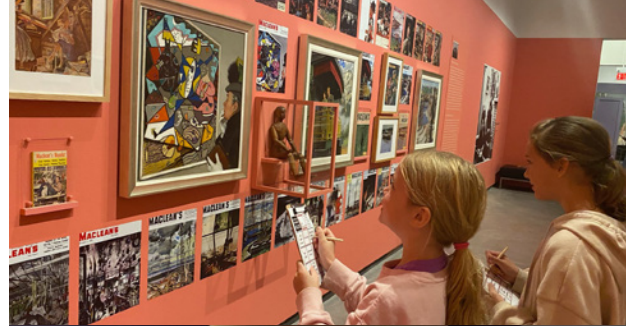
Participants from the TNT ("Try New Things") program explore the exhibition A Family Palette at JNAAG.