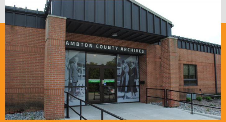
Lambton County Archives, 787 Broadway Street, Wyoming