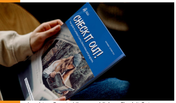
Lambton County Library publishes Check It Out magazine every other month, providing patrons with a guide to library news and programs. Printed copies are available at each library location, and the publication can also be viewed online.

The County of Lambton Cultural Services Division's mandate is to provide leadership and support to advance cultural development for economic, social and broader community benefit in Lambton County. In support of this mandate, the Division assumes responsibilities in the areas of cultural planning and policy development, capacity building, program delivery, strategic investment and resource development.